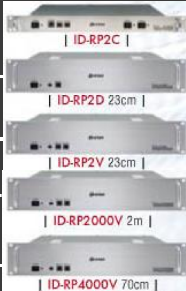
Linux Gateway PC